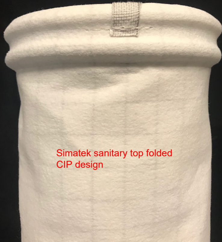
Simatek sanitary top folded CIP design

Filter bags for the food & dairy industry