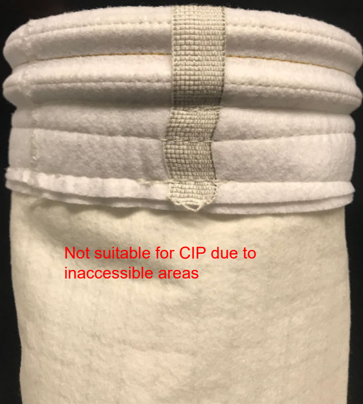
Not suitable for CIP due to inaccessible areas

Simatek has the option to deliver the filter bags either sewed or in welded design of the longitudinal seam.