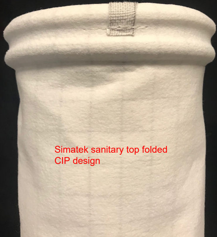
Simatek sanitary top folded CIP design

Filter bags for the food & dairy industry