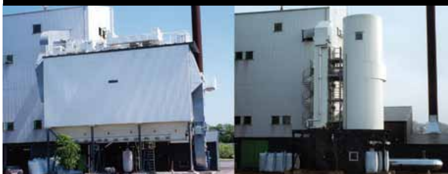
Figure 1: space optimisation – before (left) and after (right)