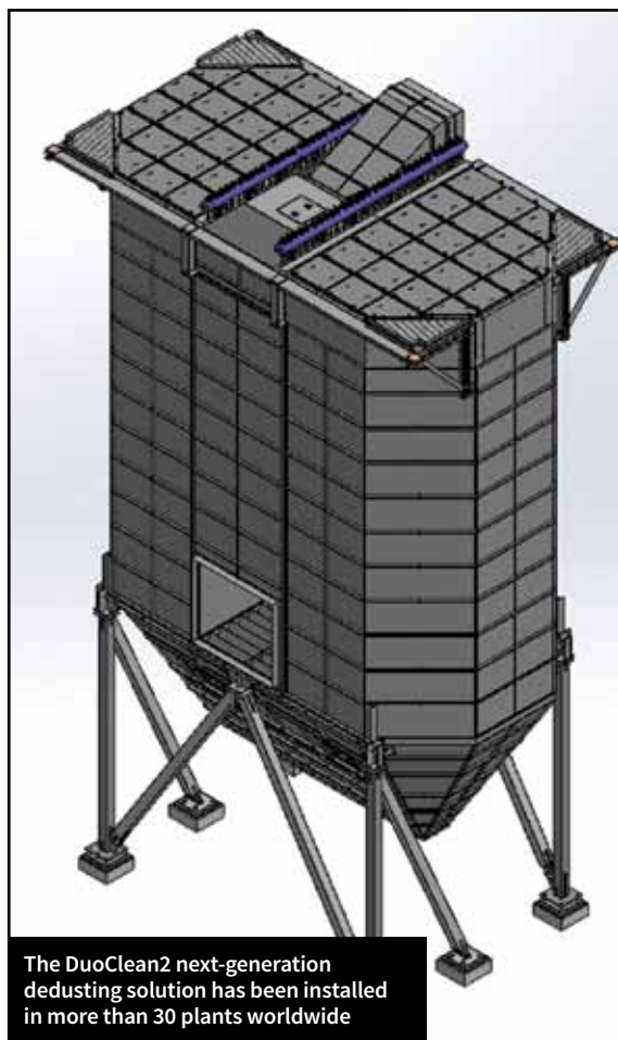
The DuoClean2 next-generation dedusting solution has been installed in more than 30 plants worldwide

enough to take the cages out of the bags.