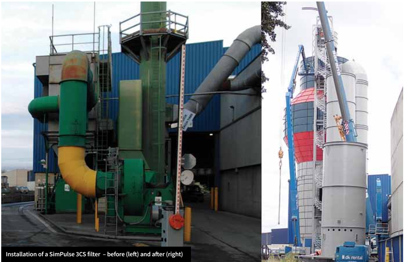
Installation of a SimPulse 3CS filter – before (left) and after (right)

The flow for the DuoClean is in the lower end, and a one-section filter can be selected. It can be sized with either 10m/127mm (10m/5in) bags or 12m/152mm (12m/6in) bags. The solution with 10m bags would have a total measurement of ~6.1m (long) x 10.1m (wide), whereas the solution with 12m bags would measure ~5.1 x 11.6m. It is also possible to build this filter as a single-line filter, which would be double in length and approximately half in width. The footprint of the DuoClean solutions would be 61m 2 and 59m 2 , respectively.